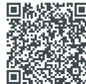
Smoke Fluid SDS

VISIT CITY WEBSITE FOR ADDITIONAL PROJECT INFORMATION AT https://www.westbrookmaine.com/916/Long-Term-Control-Plan